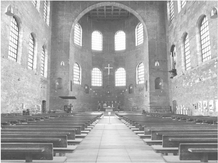
The 4th-century Basilica of Constantine at Trier

Temple terminology. House of God; Sanctuary; House of worship; Worship service. It is not New Testament Church terminology in terms of Christian gatherings, but Old Testament Jewish Temple terminology. The question then becomes: Is this a valid way to look at our church buildings?